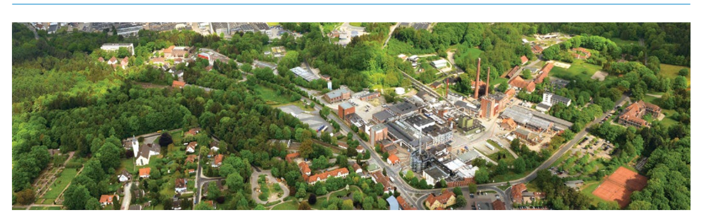
Industrial Park Walsrode

The Bomlitz site now benefits from maximum availability, alongside minimal service and maintenance interventions. In Dow's evaluation, BioTector attained the best: laboratory conformance for TOC and TN; combined monitoring on TOC, TIC, and TN; and guaranteed complete TIC removal prior to TOC and TN measurement.