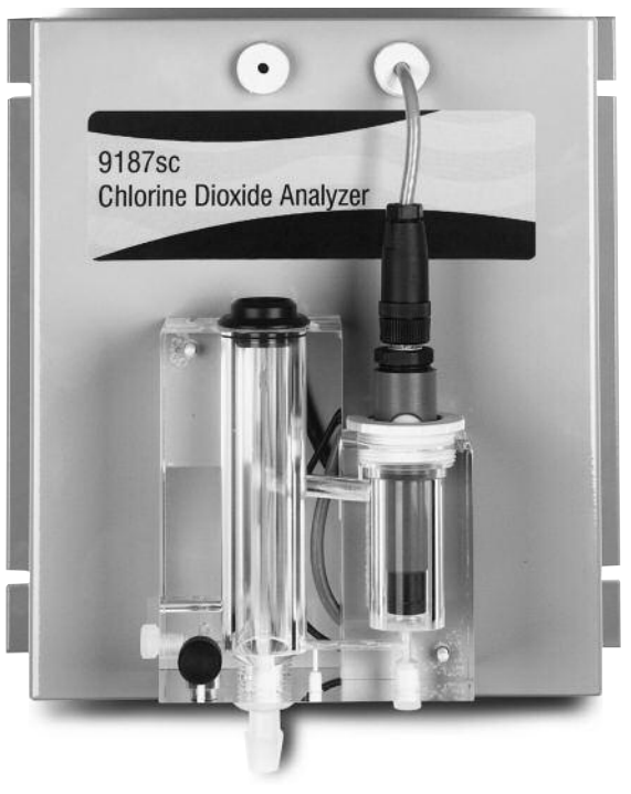
Selective membrane used in the Hach 9187 sc Amperometric Chlorine Dioxide Sensor avoids interferences from chlorine for accurate, low level measurements. Electrode membranes are pre-mounted for easy replacement.

The Hach 9187sc chlorine dioxide sensor is used with Hach's Digital Controllers. Hach's sc Digital Controllers accept from two to eight sensors. Multiple sc controllers can be networked to accommodate many more sensors and parameters, reducing the cost per measuring point. Just plug in any Hach "plug and play" digital sensor and it's ready to use without software configuration. "Plug and play" connectivity means there's no complicated wiring or set up. Network the 9187sc Amperometric Chlorine Dioxide Sensor with any of Hach's digital sensors for measuring dissolved oxygen, turbidity, ORP, conductivity, and many other parameters.