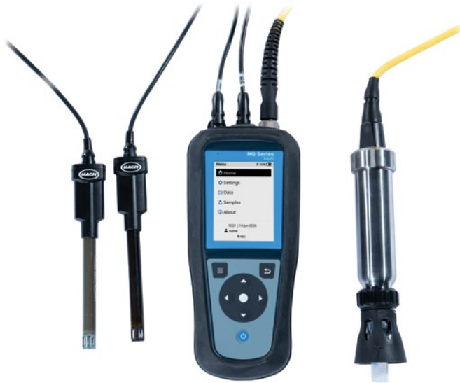
HQ Series Multi Parameter Portable Meter